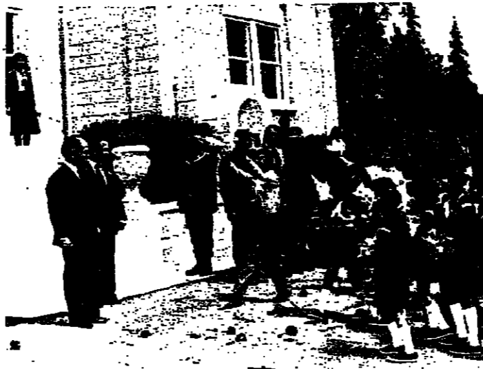
Silver Jubilee celebrations start with a touch of joy as boy and girl scouts release doves and throw roses towards Their Majesties King Hussein and Prince Mohammed at the Raghdan Palace Sunday.

France itself was deeply divided. "For France this is an evil and a cause of weakness at home and abroad", he said. "Some see the government majority and the opposition as two armies on campaign, with one having to crush the other. I reject this attitude". The president said he respected French men and women who voted for the opposition left but he simply believed they were making a dangerous choice both for the country and for themselves.